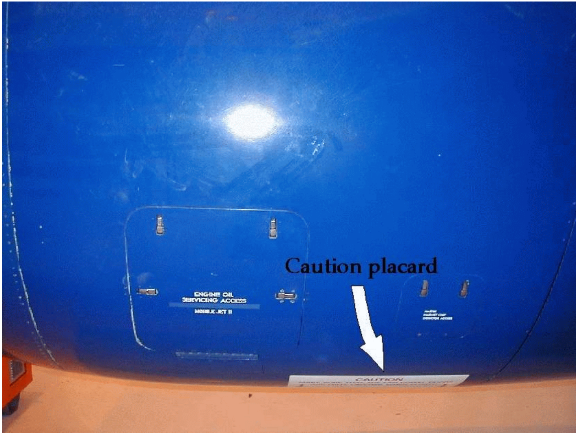
Appendix B - Caution Placard