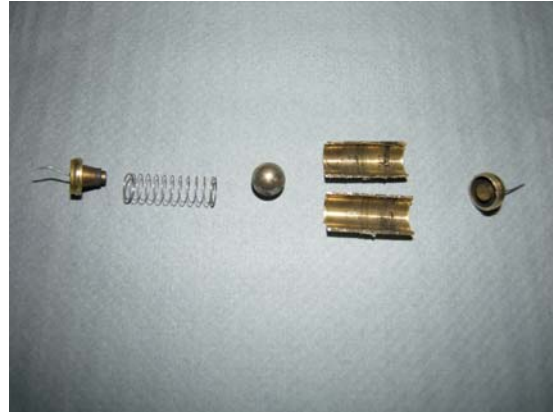
Photo 3. G-Switch split open

The single-axis, ball and spring-type switch conforms to current specifications, but activation is limited to the forces applied in the axis that the ball can travel. An impact force applied at right angles to the orientation of the switch will not activate the ELT.