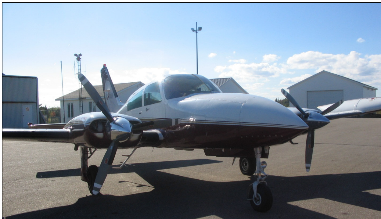
Photo 1. Occurrence Aircraft C-GABL