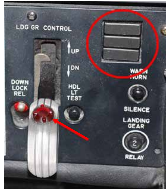
Figure 1. Beechcraft 1900D gear-down indicator lights (circled in red) and landing gear control handle (arrow)

At 0700, GGN7212 had 800 pounds of fuel remaining, and it was decided to land the aircraft. The flight crew and Air Georgian management discussed considerations of what to do with a partially extended nose landing gear. It was decided that a normal landing configuration