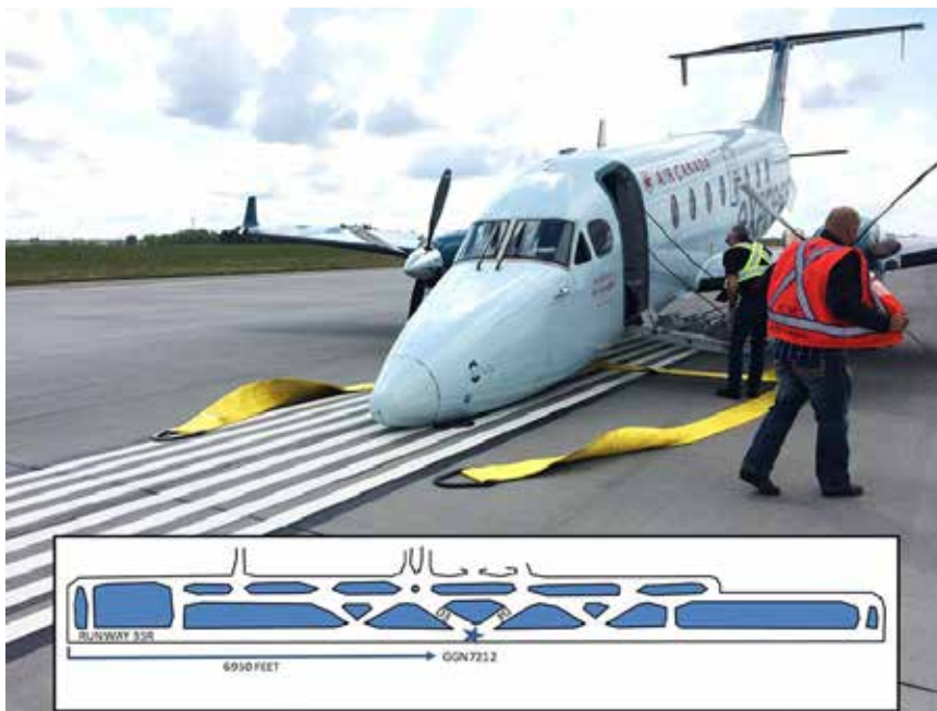
Figure 2. Resting position of C-GORF on Runway 35R

At 0717, GGN7212 was on final approach to Runway 35R and was switched from the control tower frequency to the emergency frequency. A few minutes later, at about 300 feet above ground level (AGL), the captain instructed the passengers to brace. At 0720, GGN7212 touched down on the main landing gear. The first officer feathered both propellers, 3 placed both engine condition levers in the fuel cut-off position, and pulled both FIRE PULL/T handles. 4 About 20 seconds later, the nose touched the runway. The aircraft slid on its nose for another 20 seconds before coming to a stop 6950 feet from the runway threshold (Figure 2). Emergency vehicles reached the aircraft in 30 seconds, and all passengers and crew deplaned within 1 minute.