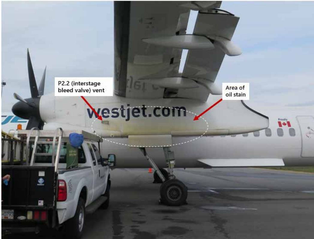
Figure 1. Oil on left engine nacelle

The outboard side of the left engine nacelle had a significant quantity of oil on it, originating primarily from the P2.2 (interstage bleed valve) vent in the engine cowl (Figure 1). Oil was also observed in the engine air-intake plenum and on the chin cowl immediately above the air intake.