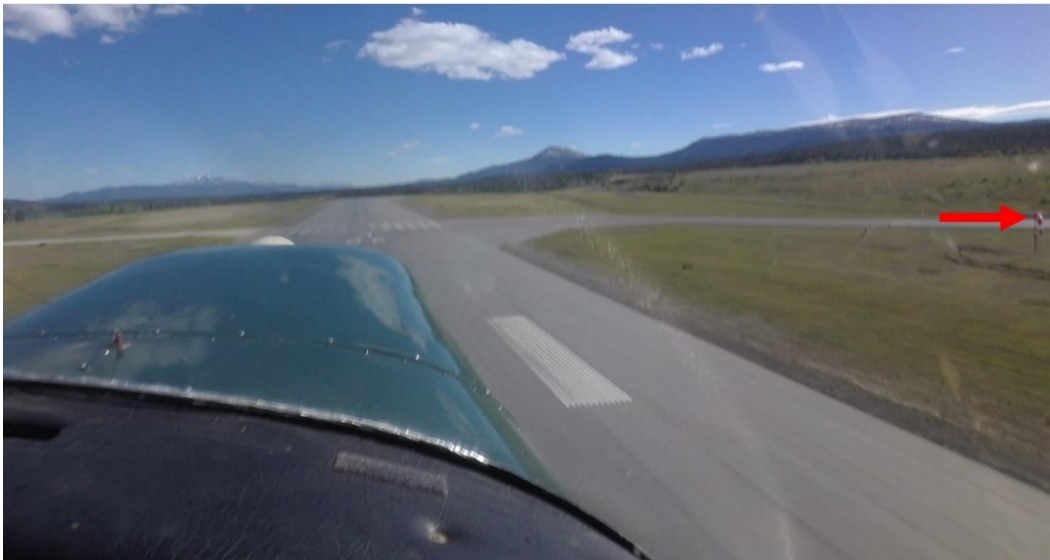
Figure 2. Image capture of the takeoff (at 1729:38). The red arrow points to the windsock at the far end of Runway 14R, indicating calm winds.

With 900 feet of runway remaining, after reaching approximately 50 feet above the runway surface, the aircraft began an uncommanded descent.