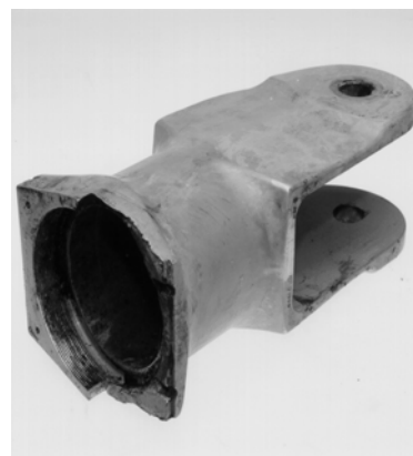
Figure 1 - Failed Blade Grip