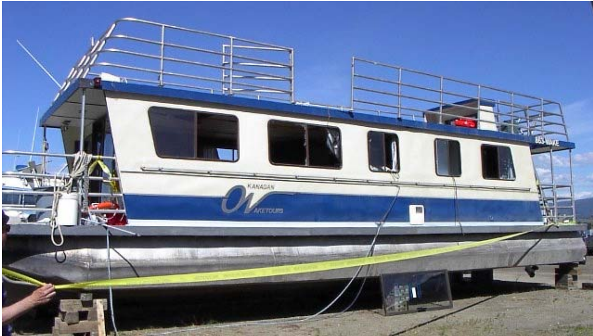
Photo 1. Quintana Roo on blocks after recovery

A compartment located within the accommodation area contained standard-type lifejackets for 45 persons.