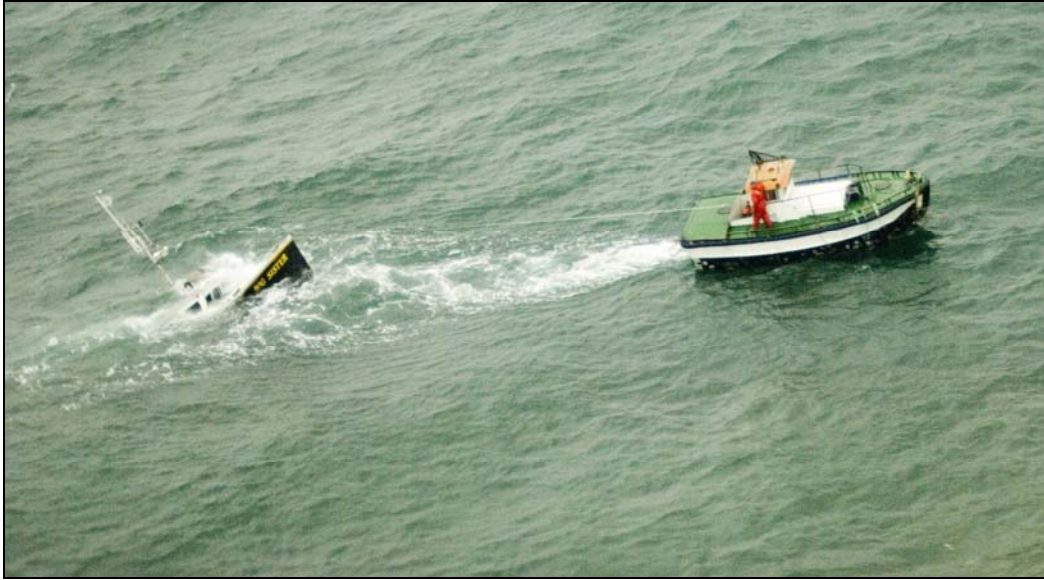
Photo 2. The partially submerged Big Sister under tow