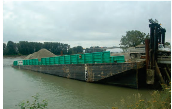
Photo 2. Barge Empire 40

The Empire 40 is a flat-decked non-propelled barge of steel construction (Photo 2). At the time of the occurrence, it had an approximate load of 3600 tons on board.