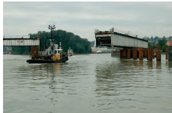
Photo 3. Queensborough Railway Bridge

The Queensborough Railway Bridge is located east of Poplar Island on the North Arm of the Fraser River. It connects the railway line between New Westminster, British Columbia, and Richmond, British Columbia. It is owned and operated by Southern Railway Limited of British Columbia and is under the jurisdiction of Port Metro Vancouver.