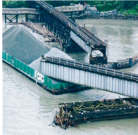
Photo 5. Barge Empire 40 and Queensborough Railway Bridge after striking

There was extensive damage to the protection pier and to the swing bridge gear mechanism (Photo 5). The leading 20 to 25 m of the protection pier for the swing span, as well as some portions of the protection pier pilings on the south side of the south channel, were extensively damaged as a result of the striking. The bridge's open swing span initially collided with the barge, before driving itself 10 m deep into the first pile of gravel, eventually stopping the barge. The current then caught the stern of the barge and swung it to port, stripping and damaging the gear mechanism of the swing span section. As it moved south, the barge took part of the swing span that was embedded in the gravel pile with it, thereby separating the span from its adjoining section.