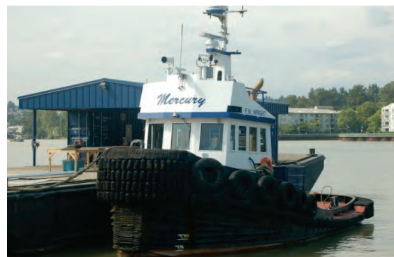
Photo 1. F.W. Wright

The F.W. Wright is a tug of steel construction (Photo 1). The navigation bridge is located on the fore part of the main deck. There is a conning position with steering and engine controls inside the wheelhouse, another on the top of the wheelhouse with similar controls, and a third immediately on the starboard side of the winch on the after deck.