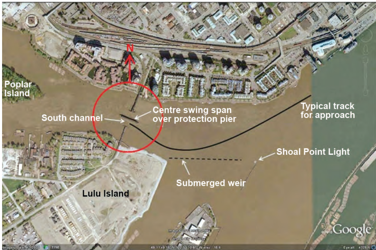
Photo 4. Queensborough Railway Bridge approach