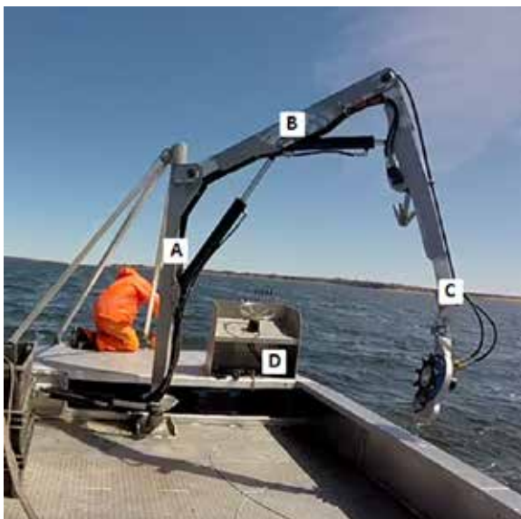
Figure 2. Crane on the aquaculture vessel (parts identified)

The crane was capable of lifting oyster storage containers weighing between 500 and 1000 kg, as well as performing maintenance operations on oyster-growing equipment. It was a hydraulically powered knuckle boom-type crane with an articulated arm (Figure 2). The arm was attached to a vertical member (king post) that could rotate about its vertical axis at the base and 2 hydraulic cylinders (lower and upper) that provided the arm linkages with horizontal and vertical motion. The lower hydraulic cylinder was connected to the king post and the lower boom arm. The hydraulic cylinder was designed to lift 13 092 kg (28 863 lb) at 20.68 megapascals (MPa) (3000 pounds per square inch) maximum working pressure.