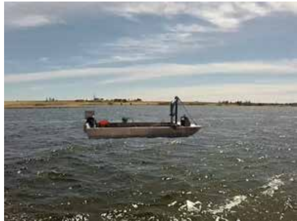
Figure 1. Aquaculture vessel

A crane was fitted adjacent to the steering location on the centreline of the vessel. Its base was positioned approximately 1.2 m inboard from the steering, propulsion, and crane hydraulic controls. Hydraulic power to the crane was supplied via a hydraulic pump that was powered by a separate gasoline motor fitted on the stern. Hydraulic pipework under the port side gunwale, which powered the crane, ran from the pump to the hydraulic crane controls that were located just forward of the steering station. A gasoline-powered wash-down pump and attached hose were fitted on the port side gunwale approximately 2.5 m from the stern. The vessel and the attached crane had been in use for approximately 2 weeks prior to the occurrence.