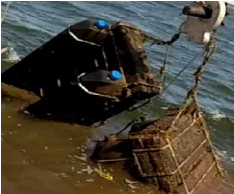
Figure 5. Oyster cage securing lines, including the attached unsubmerged main line (the main line is normally submerged, but is exposed when lifted during maintenance operations)