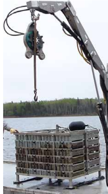
Figure 1. Oyster storage container about to be transported to another company vessel

After the containers at the plant were unloaded using the crane, the vessel travelled approximately 1 nautical mile to another company-leased aquaculture site. At this site, the crew conducted maintenance on submerged oyster cages and buoyancy devices. First they used the crane and its attached hauler to retrieve and raise the submerged cages (Figure 4). 3 The buoyancy devices were then drained, and plugs were installed to float the cages until the fall season (Figure 5).