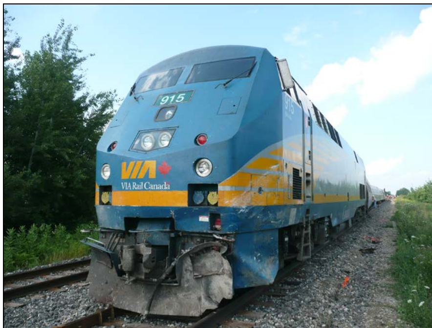
Photo 1. VIA 71 locomotive with damaged pilot

The locomotive and 4 coaches had derailed, but had remained upright, fouling the north main track. The locomotive came to rest about 1135 feet west of the crossing. The north wheels of the leading truck on the locomotive were resting on the web of the north rail. The south wheels were situated between the rails. The locomotive pilot was damaged on the left side, likely when debris from the vehicle lodged underneath (Photo 1).