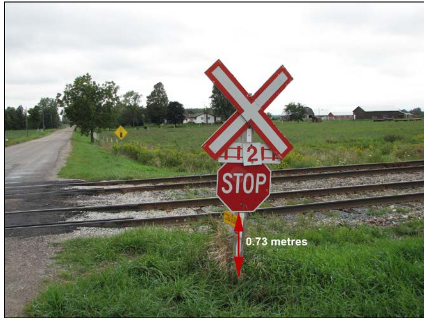
Photo 2. Signage at the South Approach (Pratt Siding Road Crossing)

Canadian National Railway Company (CN) had inspected the crossing on 06 November 2007, 07 April 2009 and 25 January 2011. During the 2007 and 2009 inspections, it had been noted that the south approach crossing signs were in good condition, but were situated too low. This condition was not mentioned in the 2011 inspection report. Based on the Transport Canada (TC) Integrated Risk Information System (IRIS) database, the crossing was last inspected on 03 May 2007. In the IRIS database, the road traffic volume was recorded as 58 vehicles per day.