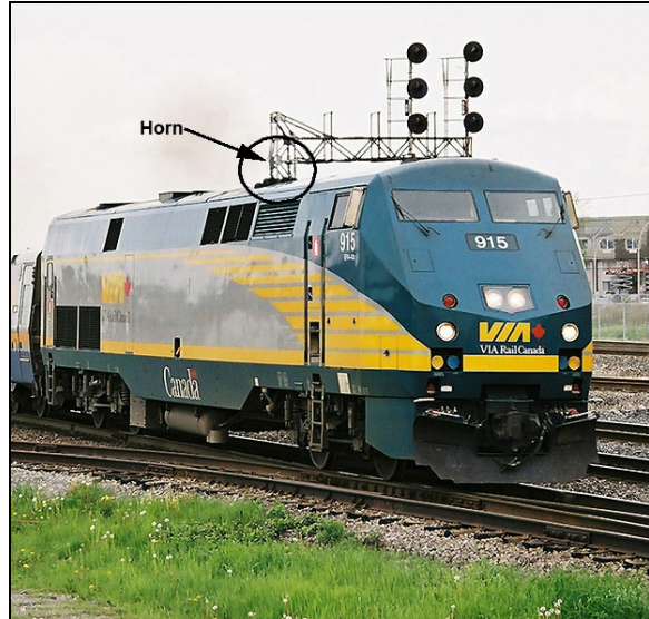
Photo 4. VIA 71 locomotive with horn mounted midway along the locomotive roof