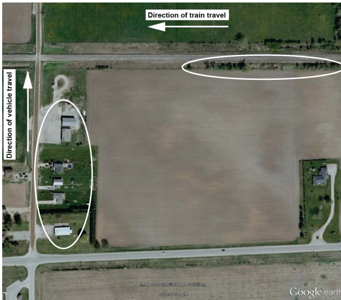
Photo 2. South east quadrant at Pratt Siding Road Crossing (Note: buildings along the road and vegetation along the tracks)

The SRCS and stop sign were visible from at least 1000 feet for both northbound and southbound vehicles. The track towards the east was concealed to northbound vehicles by buildings adjacent to the road and by vegetation along the track and in the fields (Photo 2). The sightlines at the stop sign of the south crossing approach were more than 2500 feet.