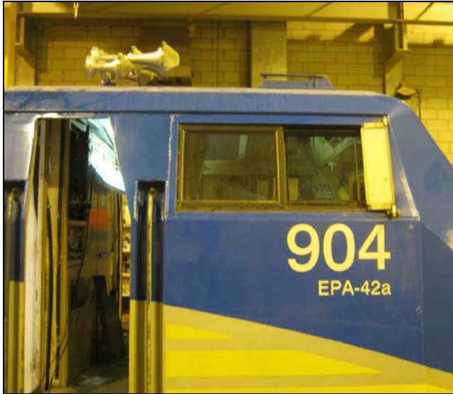
Photo 3. VIA locomotive 904 with retrofitted horn mounted near the head-end of the locomotive